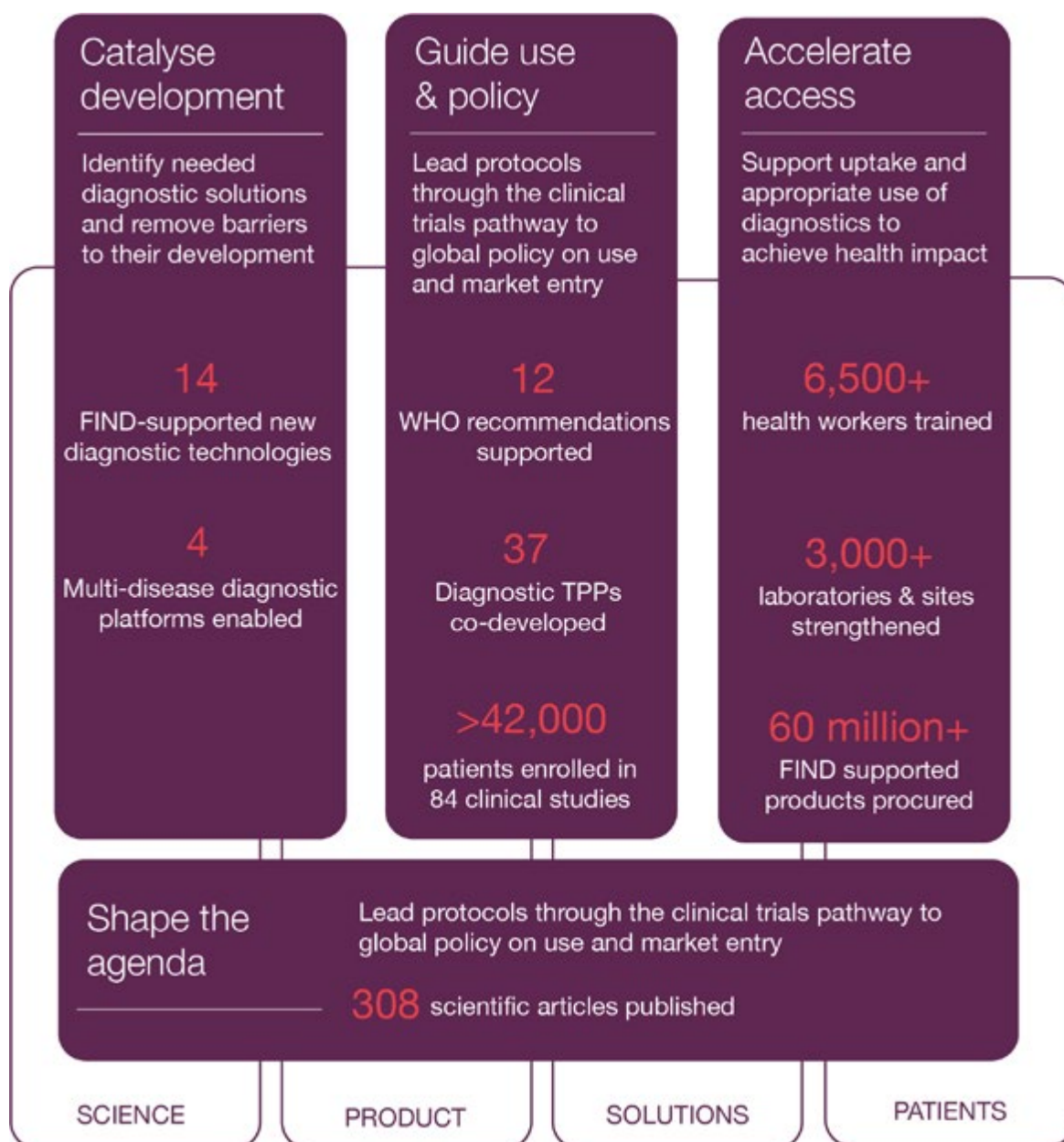
Figure 1: Bridging science and patients progress through our 2015-2020 strategic targets

The strategy comprises four pillars, shown in Figure 1, together with key indicators of our achievements so far during this strategic period.