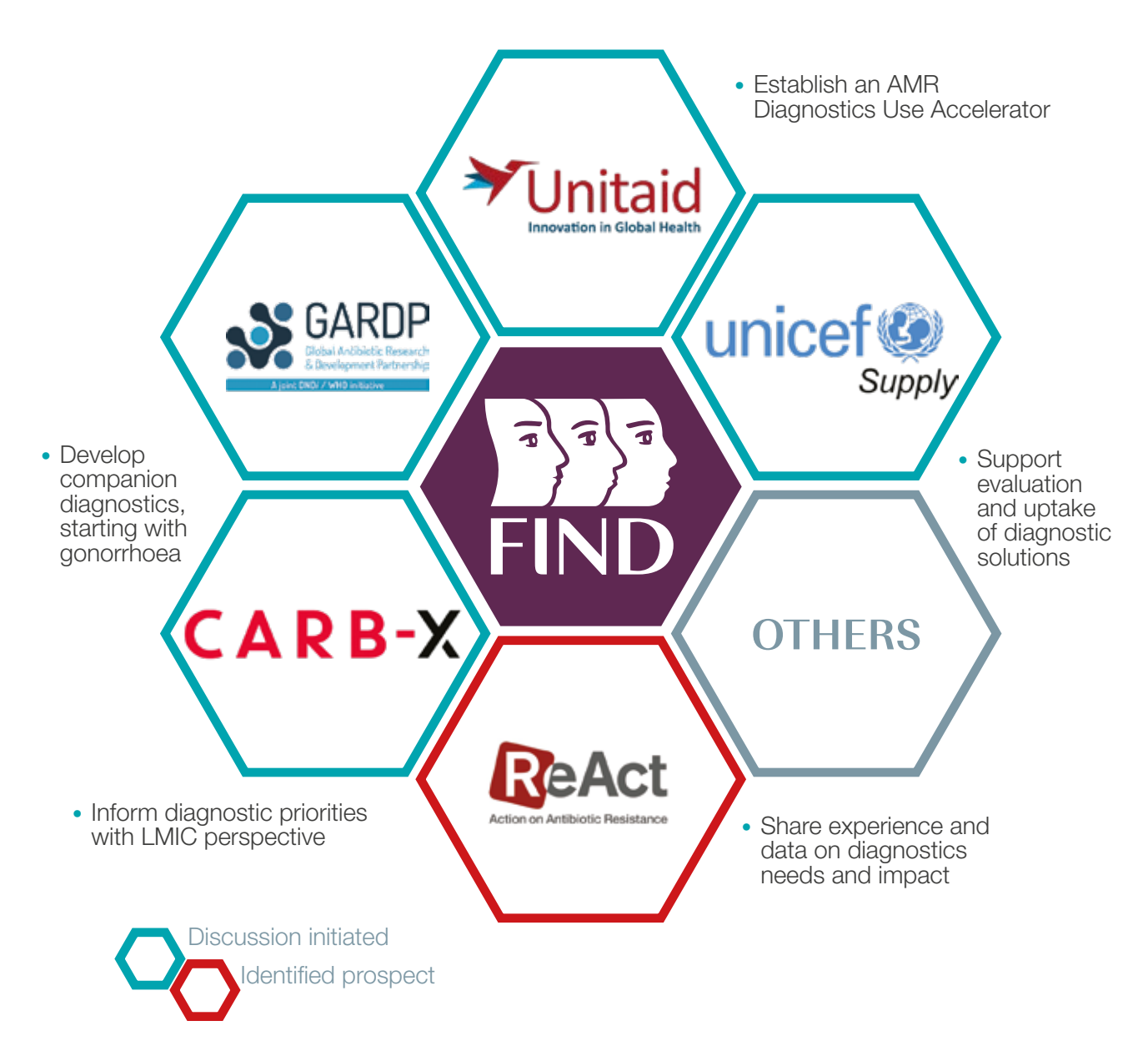
Figure 6: FIND's role in possible collaborations with key partners in the AMR response.

partners to support an integrated response to AMR (Figure 6); ii) advocate for the creation of an AMR Diagnostics Use Accelerator to establish a smooth pathway to uptake of diagnostics in LMICs; and iii) create a pull mechanism for R&D investment by creating market predictability. Through an Accelerator, cross-cutting issues such as market and pricing interventions; procurement mechanisms; policy change; information, education and communication for behaviour change and civil society engagement; and knowledge management could be most appropriately and usefully addressed.