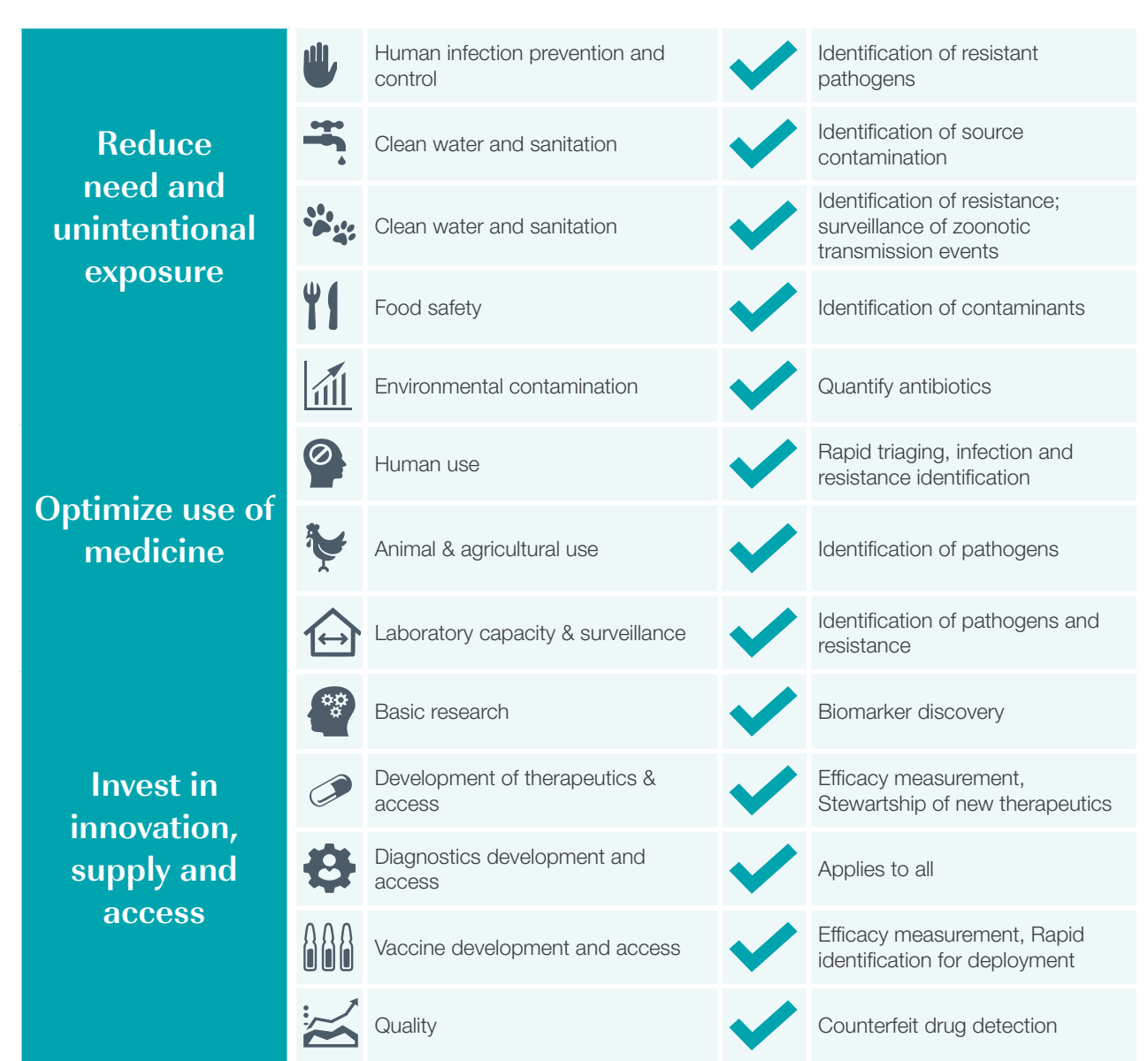
Table 1: Diagnostics underpin each of the IACG Framework for Action content areas.